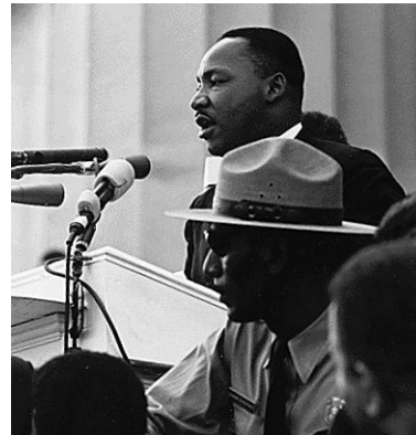
Dr. Martin Luther King, Jr. speaking at the Civil Rights March on Washington, D.C., in 1963