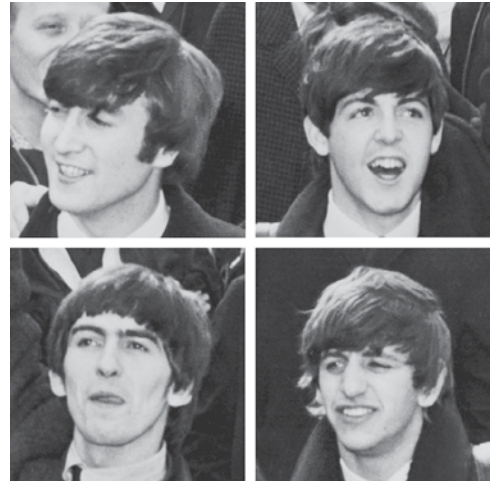
Photograph of The Beatles as they arrive in New York City in 1964

Ask a grown-up how the world has changed since he or she was born. Make a list of the ways in which the world has changed in their lifetime.